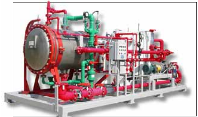
Powell Bleach Filter Unit

High flow rates at remarkably low pressures are obtained on a pressure leaf filter. A starting operational pressure drop from 2 to 5 psi is normal, climbing to 30 psi at the end.